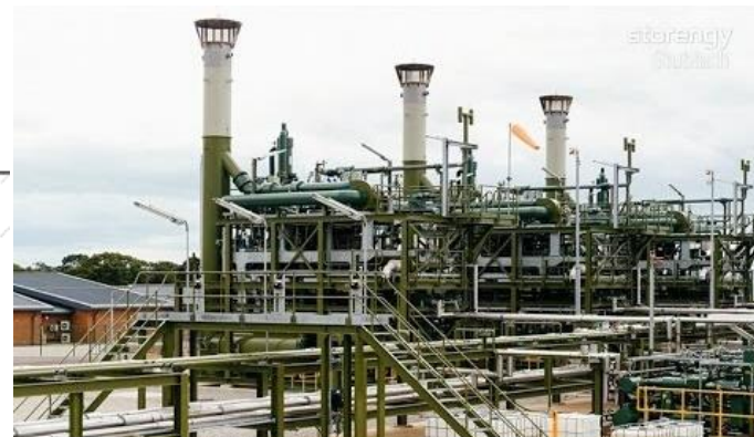
Storengy gas cavern site in Stublach